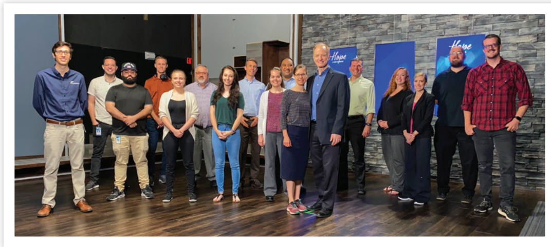
That's a wrap! The Hope Awakens production crew poses on the final day, May 16, for a photo.

the funds to reach out to those who connected with us during Hope Awakens. But we simply have to. In fact, we must reach out to more people than ever before. You know how effective health ministry is. You've no doubt heard it said that health reform is the "right arm" of the third angel's message. It's that important. And I'm committed to sharing this message.