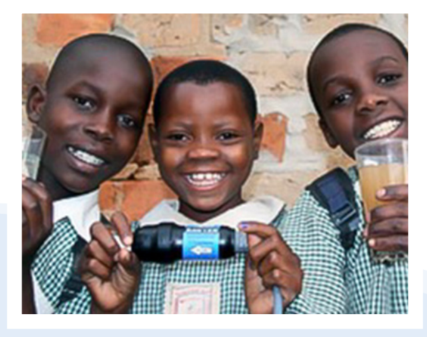
It Is Written plans to provide at least 1,500 families with water filters during our mission trip to Ethiopia in April.

One of the life-changing projects It Is Written is conducting this year is providing at least 1,500 families with water filters during our Ethiopia mission trip. An easy-to-use filtration system designed to serve a family of between 5 and 10 members can provide clean water for 10 years! These systems can filter up to one million gallons of safe, clean water, removing 99.99 percent of all pathogens. That's one and a half Olympic-sized swimming pools, or, as much water as you'd get from eight million standard drinking bottles, while creating zero plastic waste.