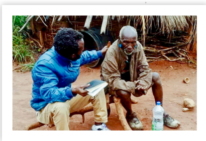
The witch doctor (right) studies with an It Is Written Bible worker.

“I am about to perform my magic, and the spirits are going to respond. You have arrived at the right time.”