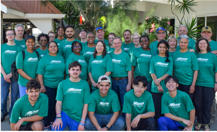
Volunteers pose for a group photo during the mission trip to Honduras in 2025.